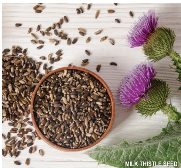
MILK THISTLE SEED

Since life is said to flow through the blood, it makes sense to naturally support the organs responsible for its quality and circulation.