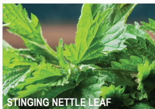
STINGING NETTLE LEAF

TIP: Can be taken with another calcium supplement to aid in absorption.