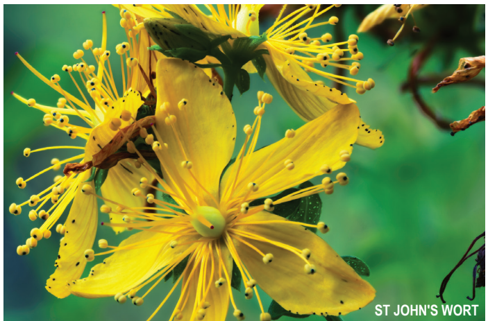
ST JOHN'S WORT

TIP: If you plan to take Gentle Birth , take Gentle Birth without Blue Cohosh/Red Raspberry with Herbal Vita-Mom .