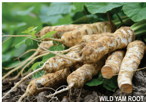
WILD YAM ROOT