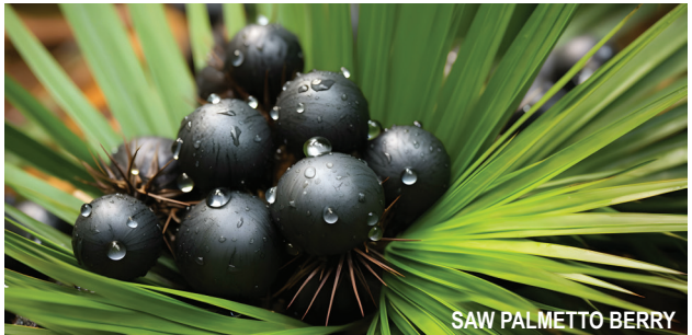
SAW PALMETTO BERRY